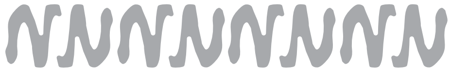
Colored papers cut in various shapes