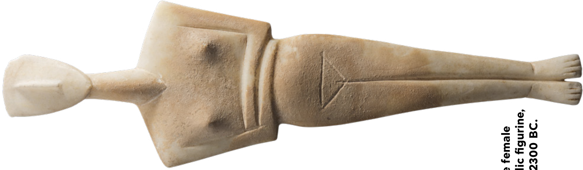
Marble female Cycladic figurine, 2800-2300 BC.